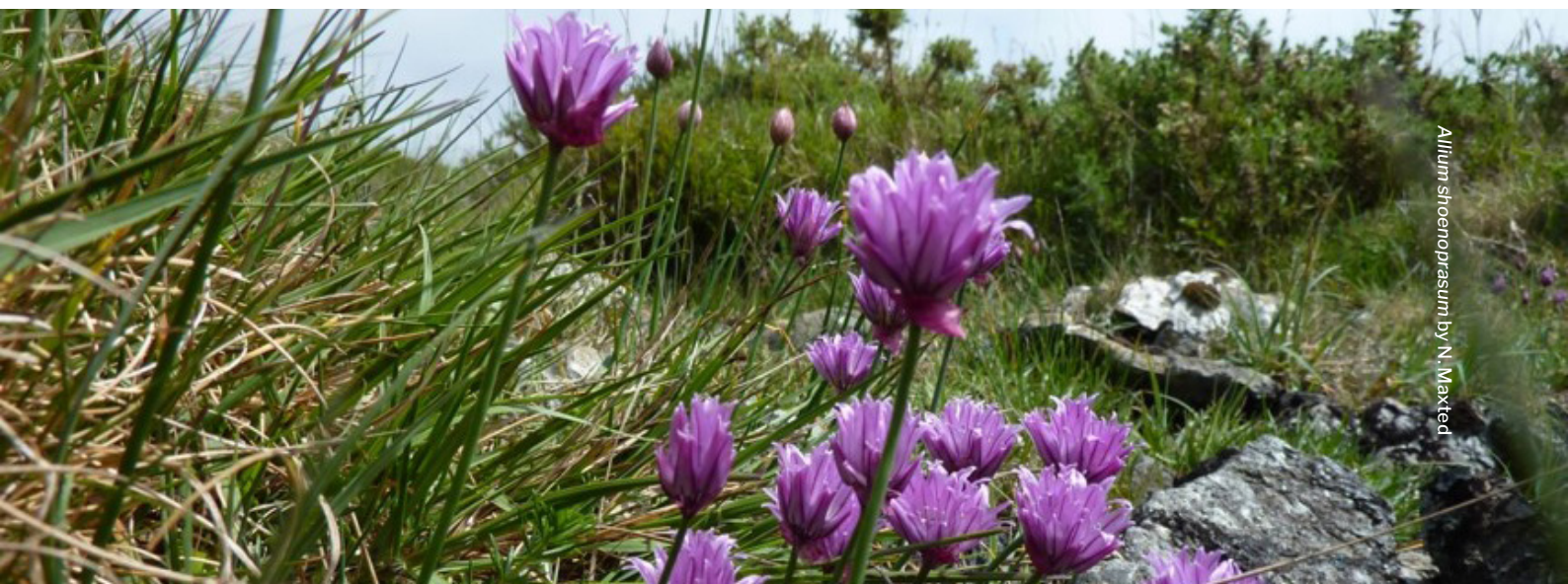
Allium schoenoprasum by N. Maxted

The virtual café is open for networking until 31 July 2021