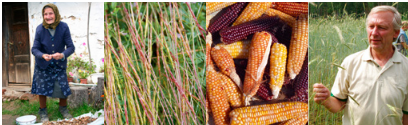
© Vojtech Holubec; © René Hauptvogel; © Filomena Rocha; © Åsmund Asdal.