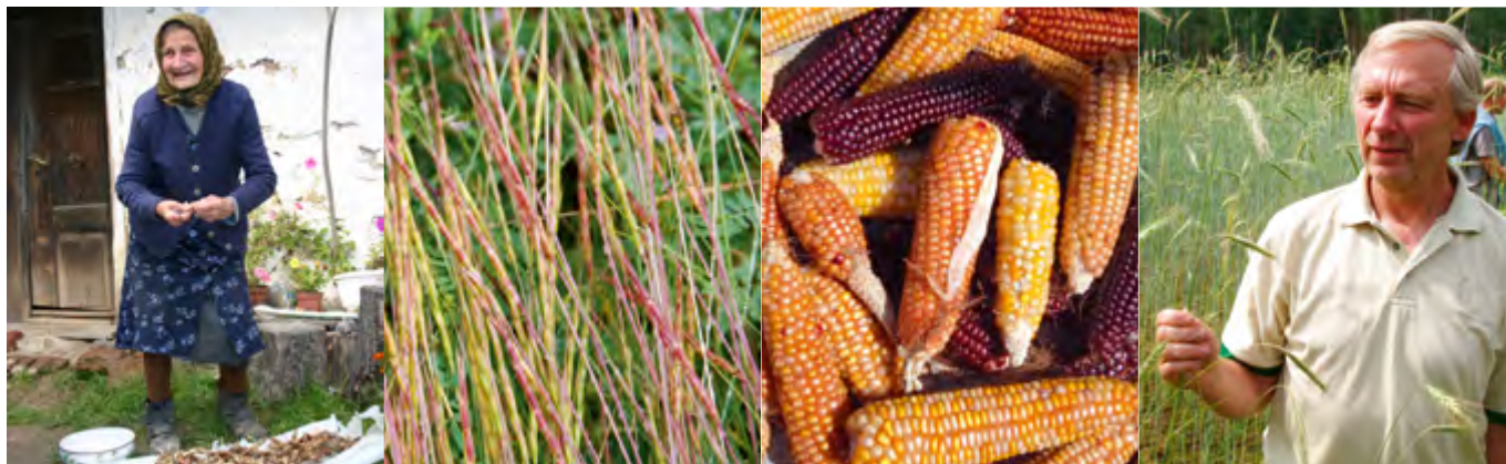
© Vojtech Holubec; © René Hauptvogel; © Filomena Rocha; © Åsmund Asdal.