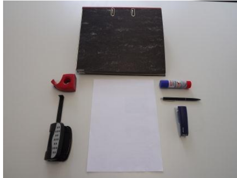
Figure 2: Layout of Items for Filing Task

Distracter objects: Pen, Glue-stick, Tape