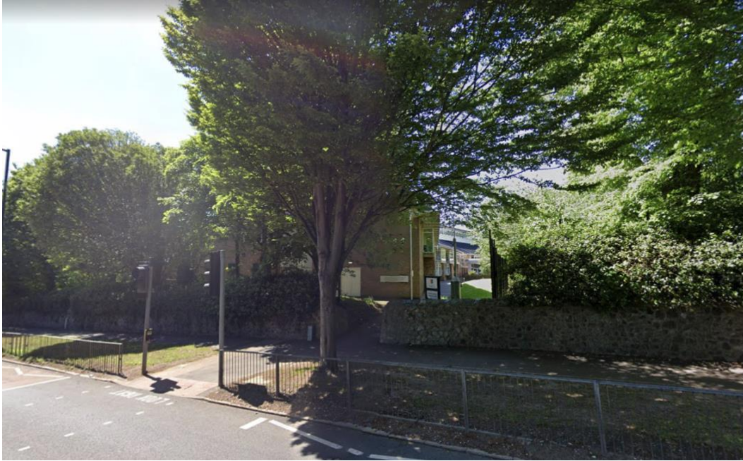
Entrance to Orchard Learning Resource Center: