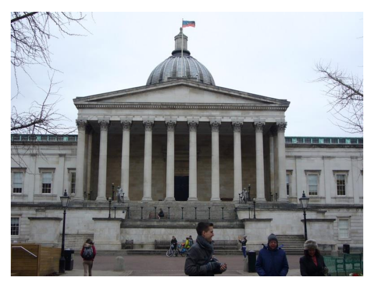
The Main Building of University College London, a key location for understanding the role of Egyptology in British universities

At the Petrie Museum, we heard about the history of the collection, which narrowly escaped bombing during World War Two, and of Egyptology at the university, including public mummy unwrappings and Petrie's annual exhibitions and sales in what is now the UCL Art Museum. The Neoclassical portico of the Main Building of UCL would have been a suitably grand entrance for the public to view the Egyptian treasures which were displayed within at these events.