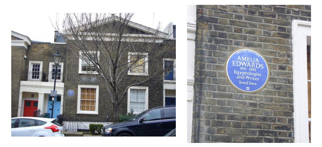
The house of the young Amelia B. Edwards at 19 Wharton St., now sporting its English Heritage Blue Plaque

Unless you are in the business, so to speak, sights of Egyptological interest in London are surprisingly hard to find (aside from the galleries of the British Museum, of course). Even the Petrie Museum (http://www.ucl.ac.uk/museums/petrie), in the heart of University College London's Bloomsbury campus, is generally unknown to tourists. In order to reveal some of the lesser known sites with Egyptological connections, the Egypt Exploration Society (EES) organised a walking tour of Clerkenwell and Camden on Saturday 21<sup>st</sup> March. This event served also to celebrate the unveiling of the English Heritage blue plaque at 19 Wharton St., London to commemorate Miss Amelia B. Edwards, author and co-founder of the EES. This event took place on Thursday 19<sup>th</sup> March and a report can be read here: <u>http://ees.ac.uk/news/index/303.html</u>.