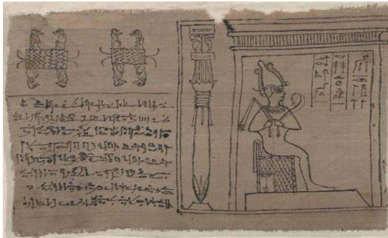
Section of the Book of the Dead, Chapter 125.