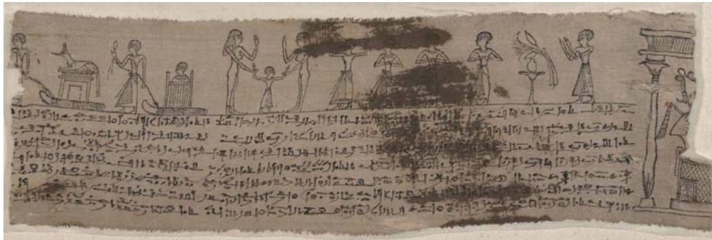
The beginning of the Book of the Dead, Chapter 1.

The surviving fragments in the Mingana Collection contain sections from chapter 125 of the Book of the Dead, the vignette from chapter 15 (previously regarded as chapter 16), the beginning of chapter 1 and finally a large section of chapter 17. Bitumen stains are visible in particular on the second and third fragments.