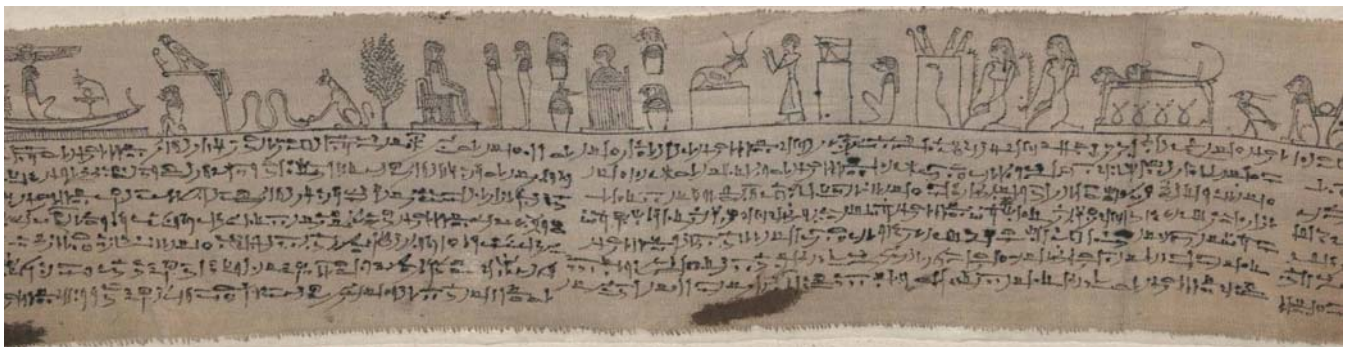
Section from the Book of the Dead, Chapter 17.

Further research is needed to ascertain the context of the Birmingham mummy wrappings. The Department of Classics, Ancient History and Archaeology, of which Egyptology is a part, together with CRL are currently looking into a multidisciplinary approach to the understanding of these exciting artefacts, hopefully leading to a publication.